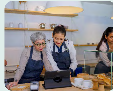
Food Safety Culture