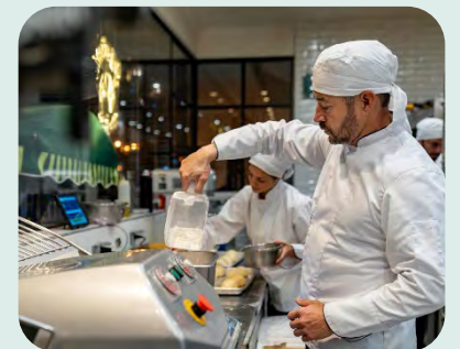
Food safety management skills