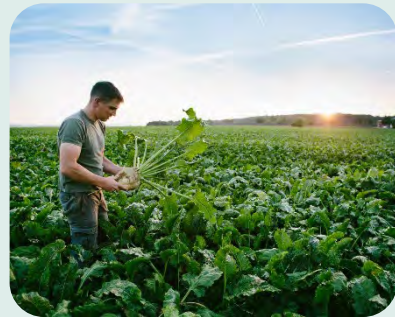
HACCP & GMP